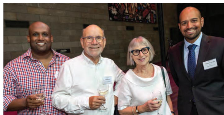
Observer and Board Directors, Sacred Heart Mission