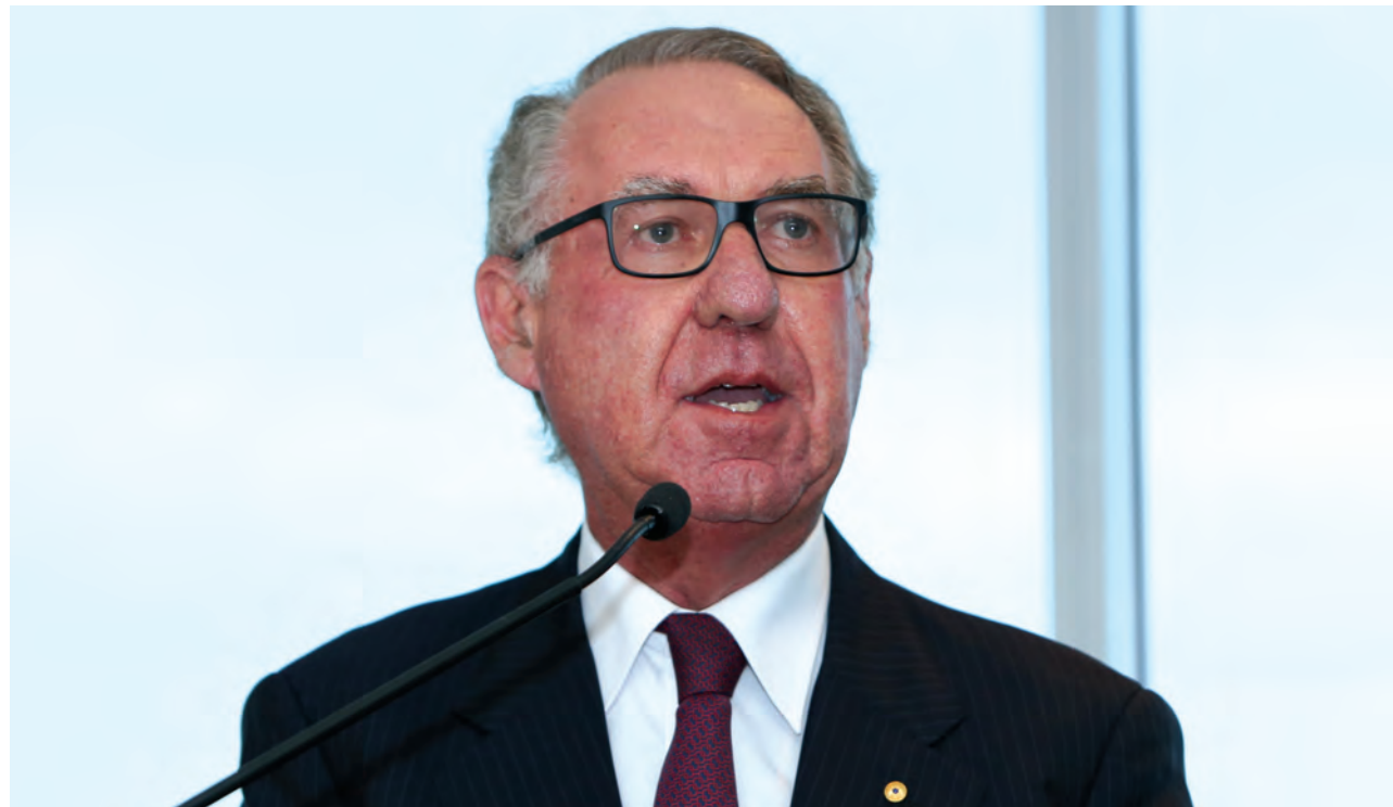
David Gonski AC, Observership Program Patron

The board of The Observership Program has an Observer each year.